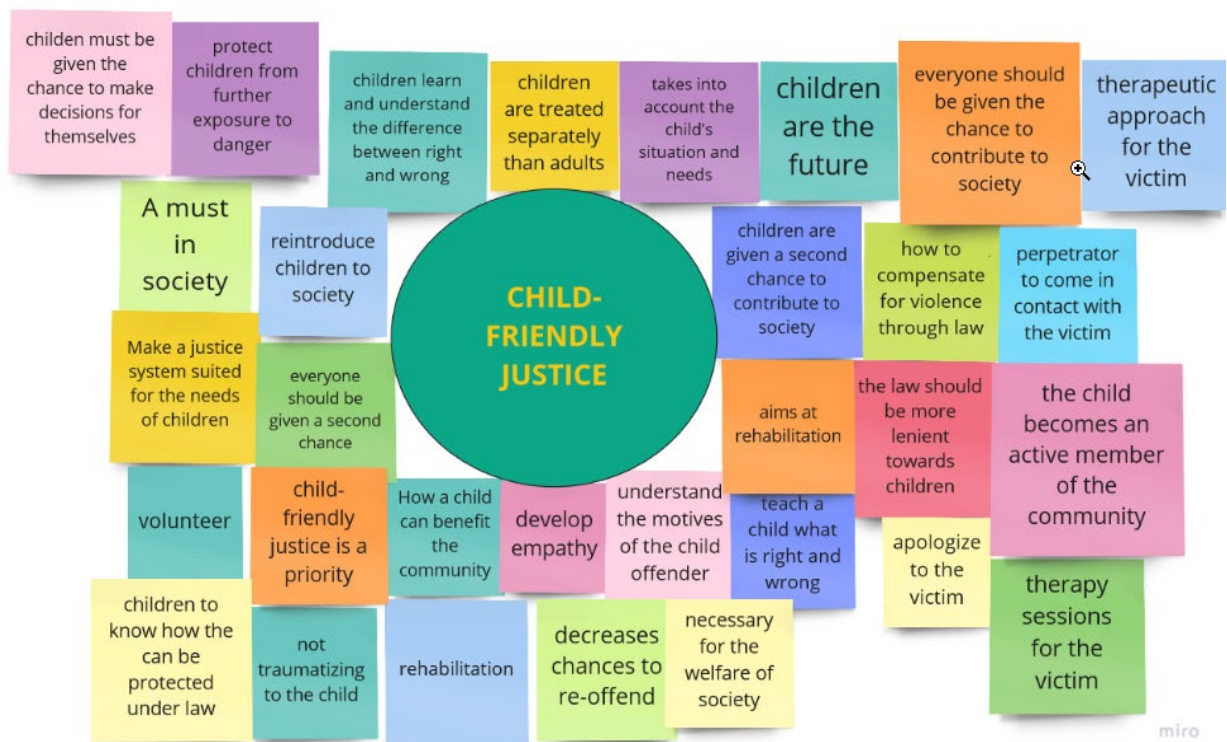
Screenshot of the responses from Children's Focus Group in the Netherlands answering the question "How do you envision child-friendly justice in the future?" – November 2020